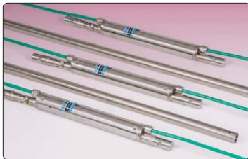
● Model 6150E-2 MEMS tilt sensors and stainless steel tubing.