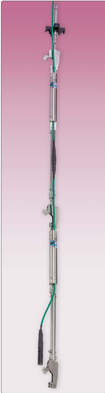
● Model 6150E-1 MEMS In-Place Inclinometer.