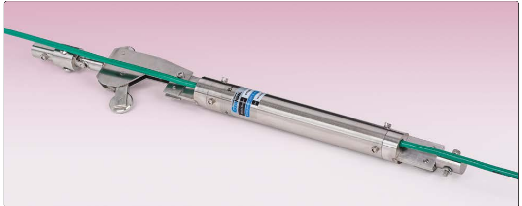
• 6150E-1 Biaxial MEMS Tilt Sensor.