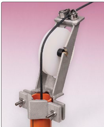
● Model 6000-6 Inclinometer Cable Pulley, shown attached to Model 6400 Inclinometer Casing.