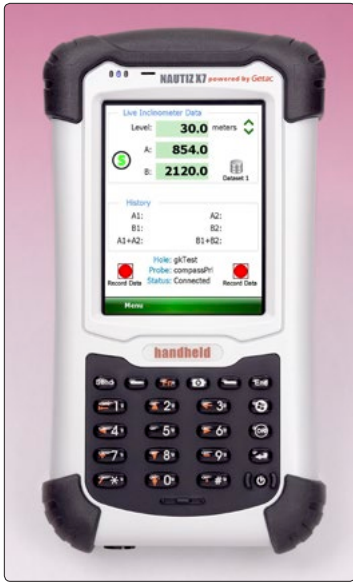
● Model FPC-1 Field PC showing an inclinometer data reading screen shot.