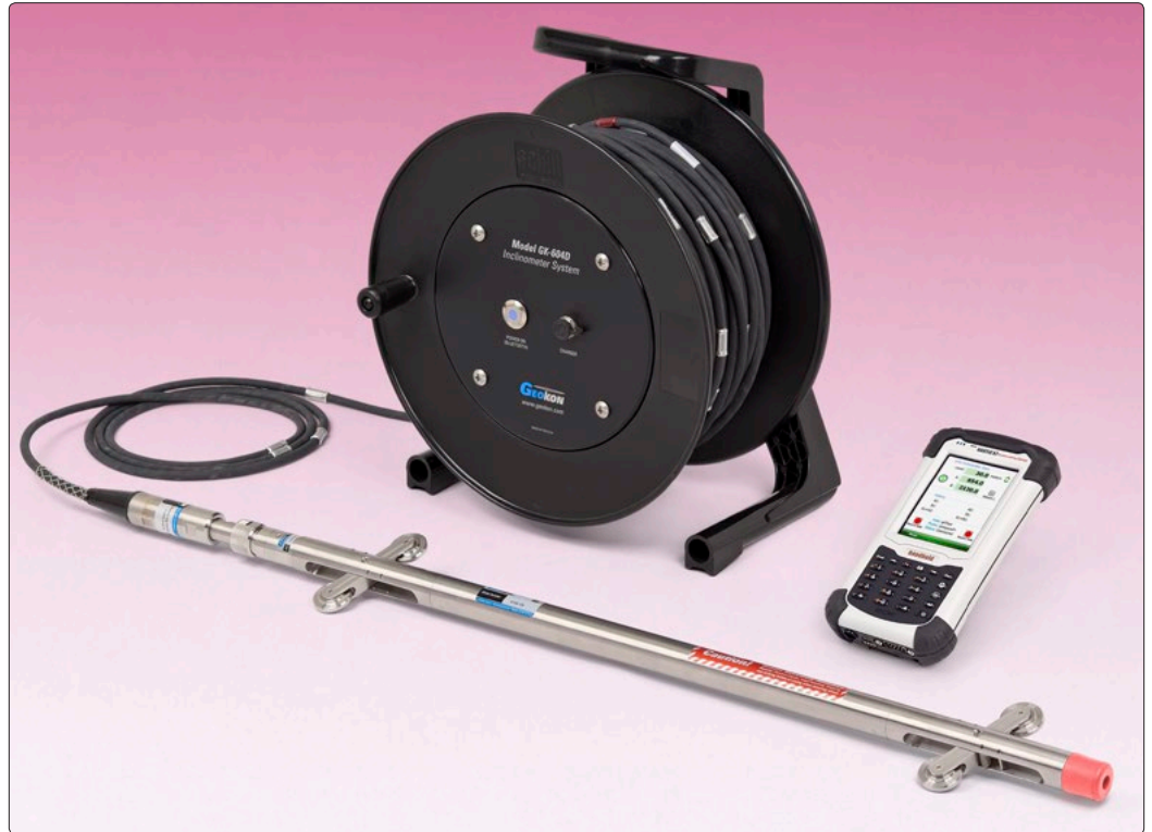
• Model GK-604D Digital Inclinerometer System.