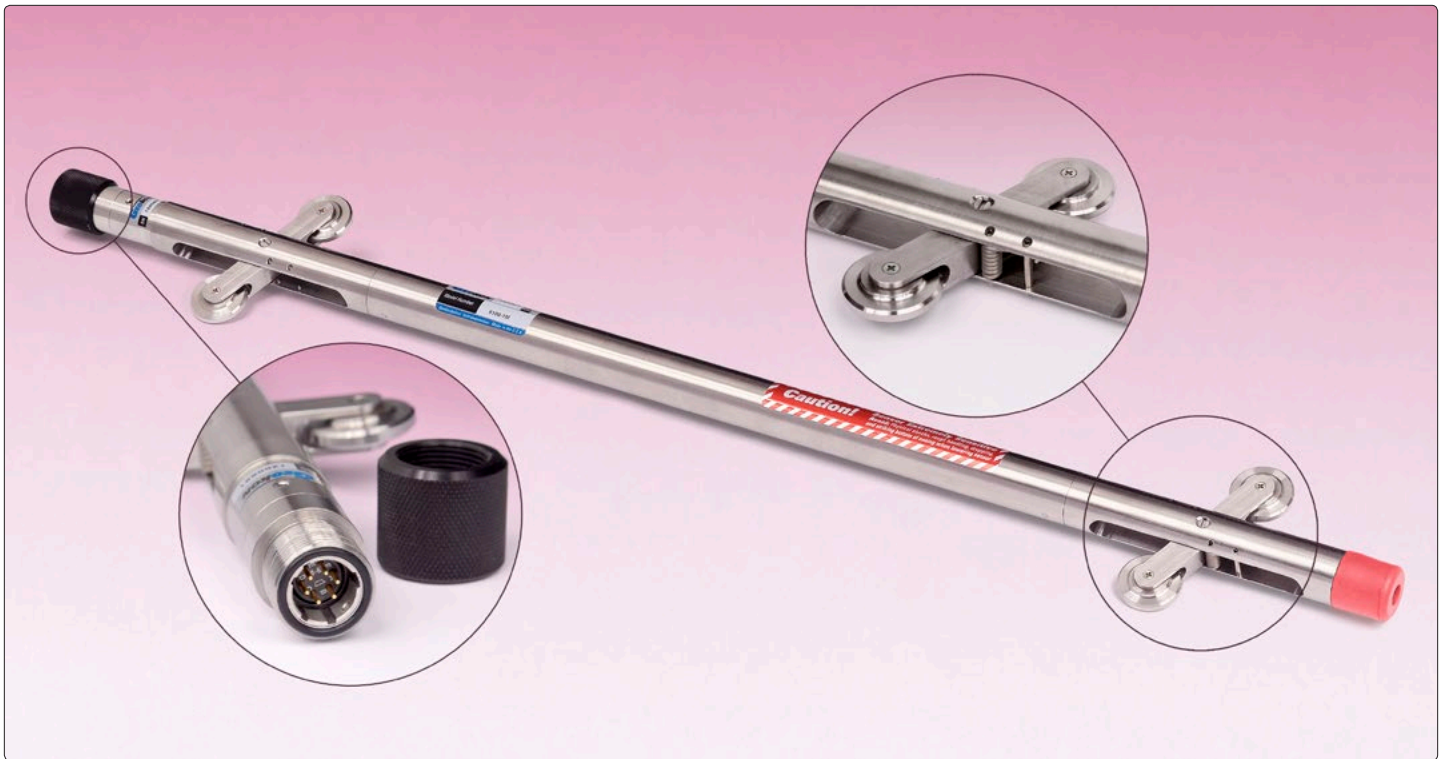
• Model 6100D Digital Inclinometer Probe.